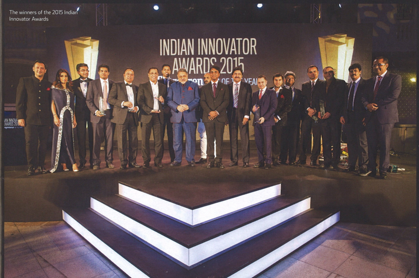
The winners of the 2015 Indian Innovator Awards